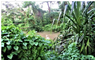
Both sides of our Biologic Island Preserve now completely blocked.