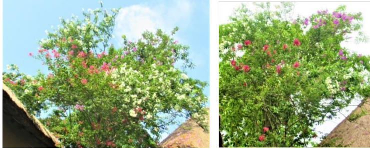
The three colours of the lilac-tree, between Gandhi Bhavan and Malala girls Home.