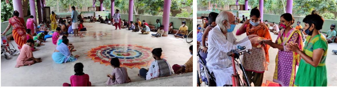
We celebrate with all our young people, the end of the fasting of our own Muslim girls and boys.

NEVER HAVE WE SEEN SUCH A TRANSFORMATION OF OUR LANDSCAPE WITHIN THREE WEEKS, CONSEQUENCES TOGETHER OF THE SO VIOLENT RAININGS OF THE CYCLONE ‘YASS’, THE EXTREME PEAK OF THE HEAT, AND THE EARLY ARRIVAL OF THE MONSOON!