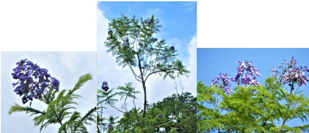
This Jacaranda, is one of the most beautiful tropical tree, has been planted 16 years ago, but has never produced more than two flowers, except this year...around 15. But the proper number must be thousands!