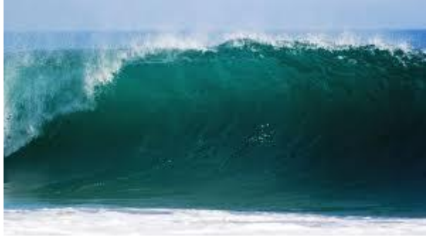
Le tsunami 4 m. high and more, which has ravaged all along the coastline several km inside.