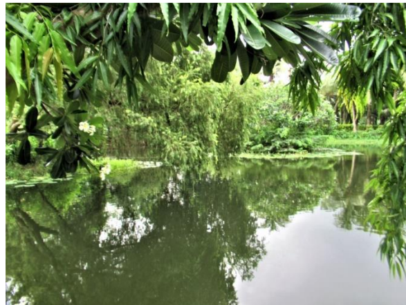
Landscape of the pond with its three islands or peninsula...