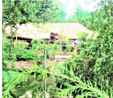
GANDHI BHAVAN, seen from the island.