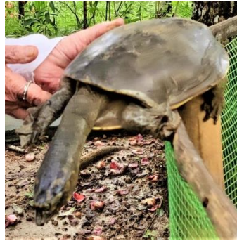
Bengali Terrapin tortoise. Around 2 kg and no more yellow designs are the proof of its old age ! Very welcoming host for our pond.