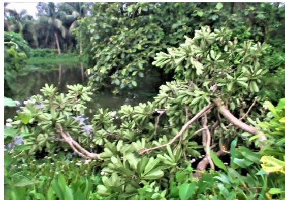
Uprootes this week by heavy rains. All of us are very sad!