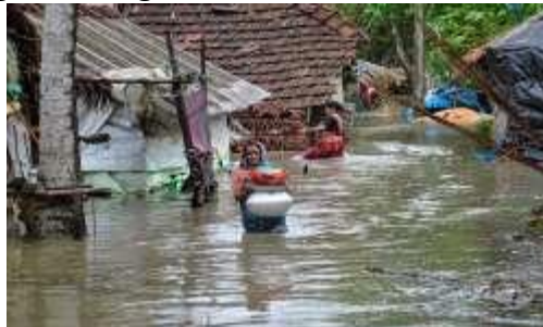
How to repair my house and when, since it is the second time in two years ?