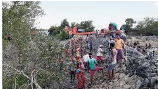
Repairing of the broken dikes by the inhabitants themselves ! A huge and never-finished job, as I have seen by myself 35 years ago working with them!