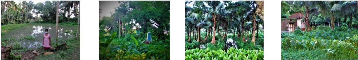
View of football ground aside the 'Mother Mary's Grotto' and under the Temple. Our workers' corner