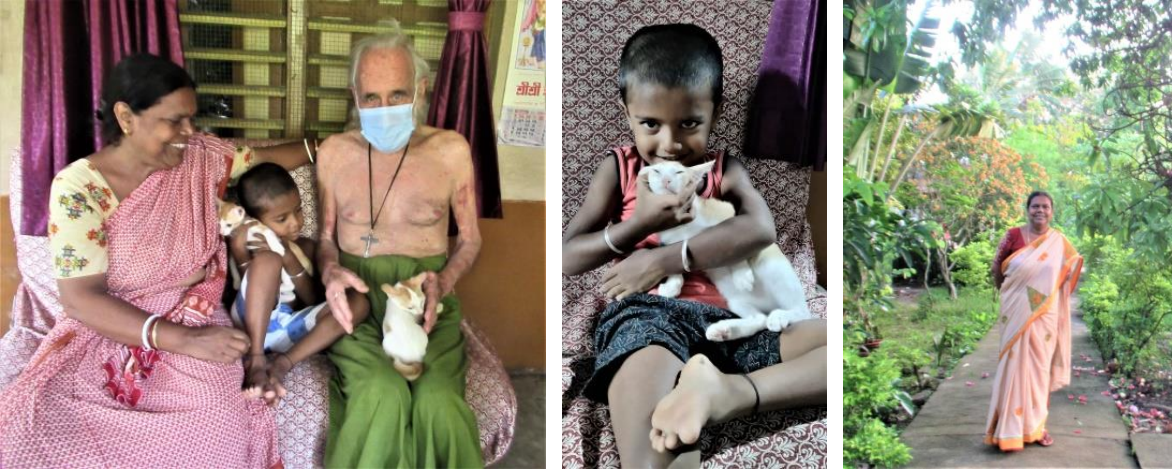
First time after 26 days I could stand. But the “nati” is quite more active, and so his “Didu” Secretary who still hold everything in her hands!