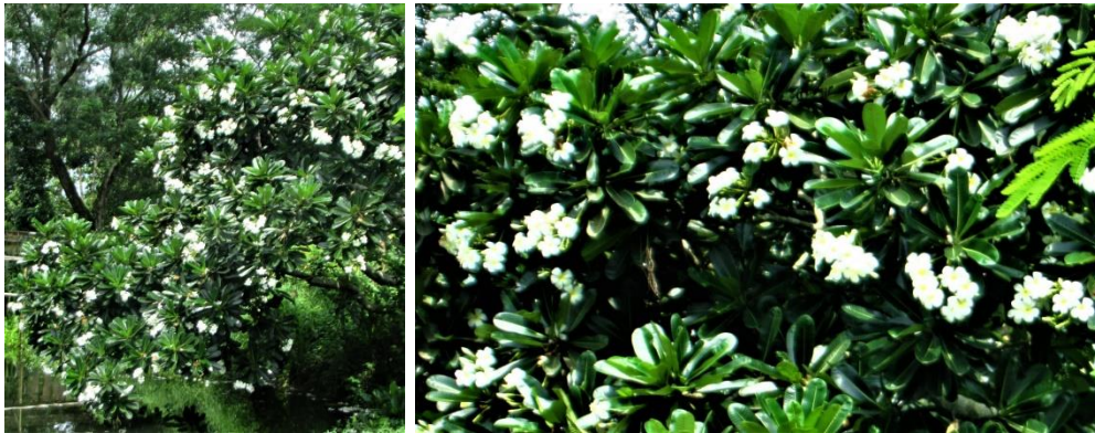
The largest of our 20 Frangipani (Temple trees)