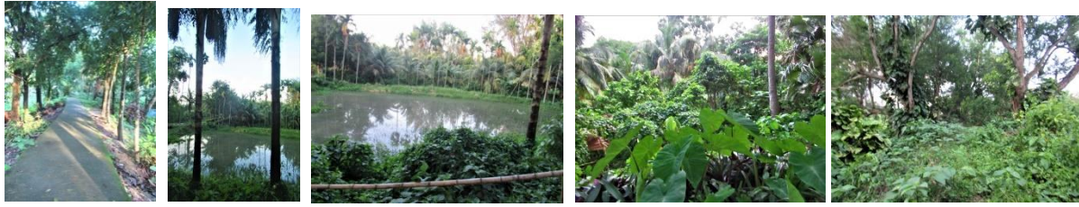
Several views of the modified aspects around the Temple, from above and from down.