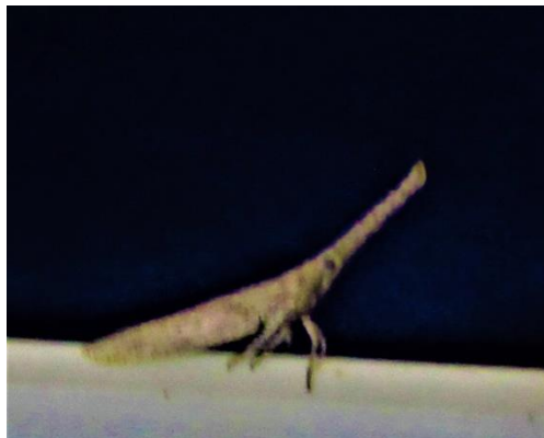
Absolutely unknown insect . What's the use of this long ram above its eyes? (3 inches)