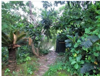
The little path going to the women-ghât always becoming narrower...due to extreme vegetation