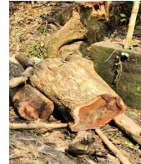
Trunks of trees that we have sawn...

WE SHALL SEE AT THE END OF THESE PAGES, WHAT CALAMITIES SO MANY PEOPLE ARE LIVING, EVEN TO-DAY, AFTER HAVING BEEN RENDERED VICTIMS OF LAST YEAR 'AMPHAN', AND THIS YEAR 'YAASS', ESPECIALLY THOSE WHO ARE LIVING WITHIN TEN KM ALONG THE COSTAL LINE OF BANGLADESH, SUNDARBANS, MIDNAPUR AND ODISHA. HOW ARE THEY STRUGGLING UNCEASINGLY SINCE TWO YEARS!