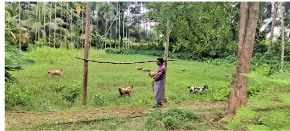
Looking about the goats and sheep is clearly easier!