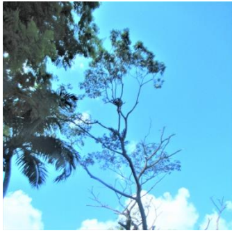
Higher and higher... no cyclone will have grasp upon the smallest branches, even if leaves grow again!