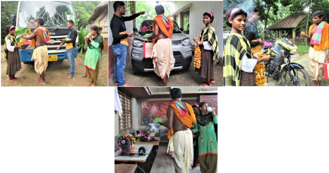
Minibus, auto, motos, bicycles, sewing machines etc.