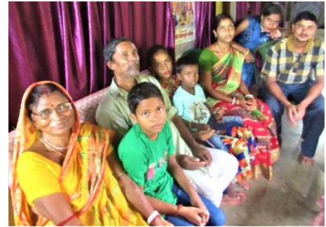
First visit of their in laws.