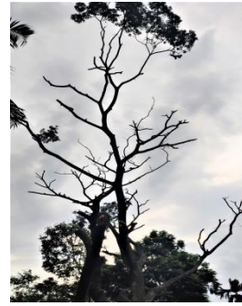
The tree's balance now is re-established, and no cyclone will have grasp upon the smallest branches, even if leaves grow again!