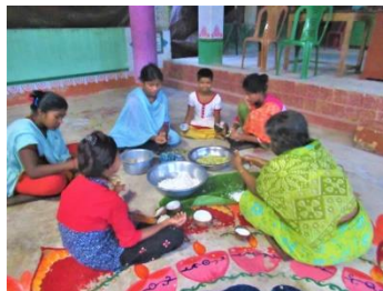
It is a tedious work which will take several hours here, including pastries' cooking in the kitchen.