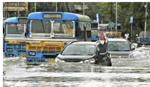
Kolkata, 20th of September