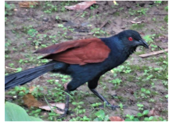
« I have never seen this bird!”...But it is a rare Dictyophera asiatic myshroom!