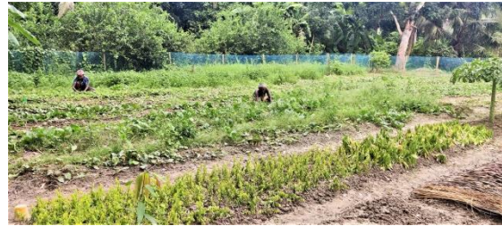
Clearing the ground is very tiring job.