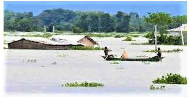
What a resilience! And if we were in their place, what’s about our reaction?