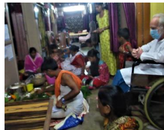
Our Veranda is very narrow, and I have found a place at the entrance of a room.