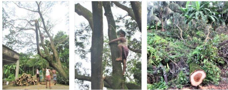
Some professionals are cutting the larger branches, but cannot climb higher. One must call a more courageous group to cut the higher branches and leaves.