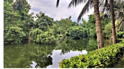
Hedges and coconut trees leaves are pruned by a professional friend, free of cost.