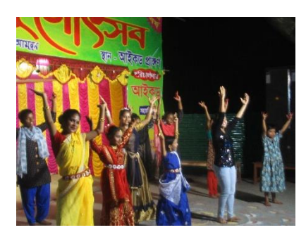
Dances of our girls and of several folklotrik bands that are producing themselves free of cost.