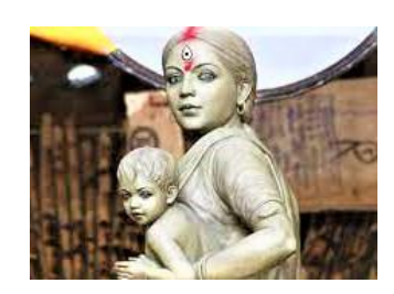
She is an Indian Muslim, but put in a <u>detention camp</u> for being foreigner. Another is chased from her home, looking in vain for work...