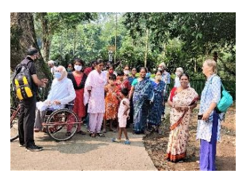
Bye-bye and thanks + promises of future