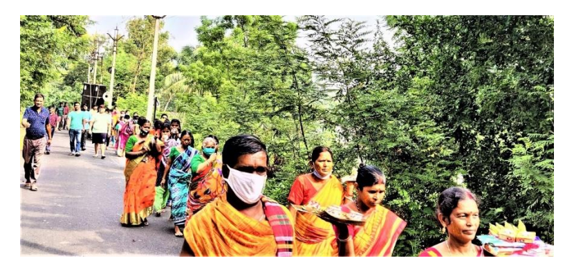
Along the road tu return Durgama where she was coming: the Damodar river, where from she will come back in 2022