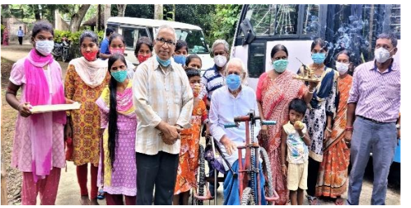
After two years, fraternal embrace from my father cum friend. All are so happy to see his simplicity and warmth!