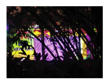
Preparation of the « Pandal » by Binay View of the illuminated tent from my back-window.