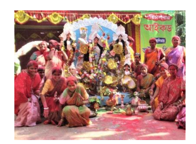
Joy and sadness are mixed, but the merriment is great!