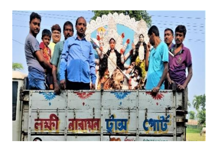
Ultimate picture... Gopa leaves with the 'heart' of Durga. 'Thakur' Put on the lorry