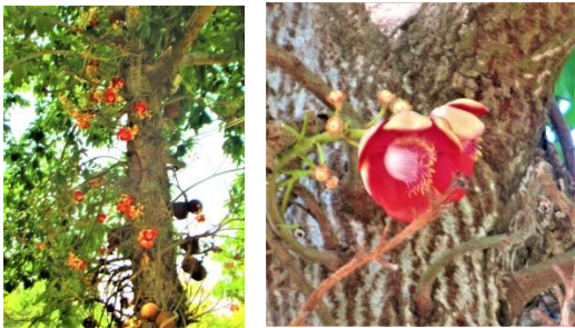
Canon ball-tree (Curupita)18 m.)