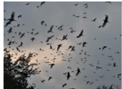
When twilight starts around 5.30 PM, large flights arrived cautiously forming impressive spirals, always lower...