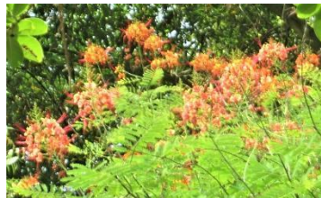
Chinese pride, Hybride in 3 shade : 3 m.