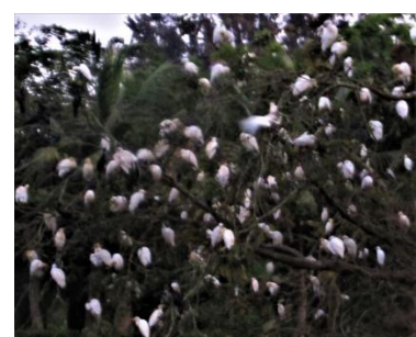
They take time to find their final place, while Mother Teresa statue supervises them...