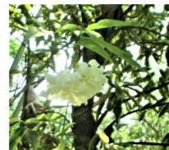
“Lahura tecoma: Temple gold tree »: 3 m. Unknown, 2 m. This white flower blossoms very rarely and in the summit only: 6 m.