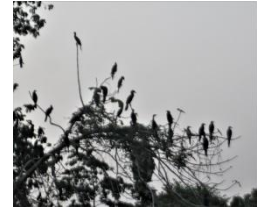
Cormorants are the first to roost, around 5PM. (We can apperceive our 'Gandhi Bhavan' Home at the upper right of the first picture)