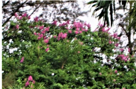
Wild lilac :10 m.