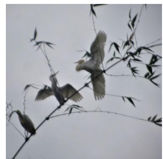
Some egrets follow earlier and settle on bamboos, like Japanese prints...endlessly quarrelling and cackling, waiting for the large groups to arrive...