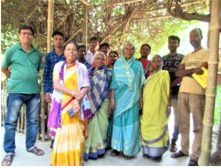
Invitation Committee came at ICOD.