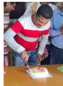
... and with his friends the permanent workers of ICOD