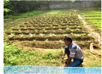
In front of the dispensary, with six kinds of vegetable...