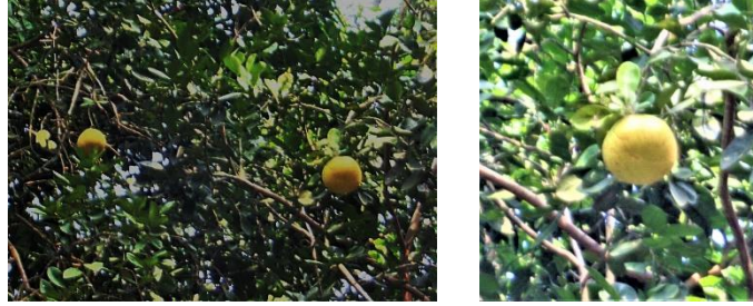
We have five grapefruits-trees dispersed in the jungle