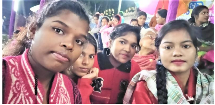
Our four Class X students are observing...