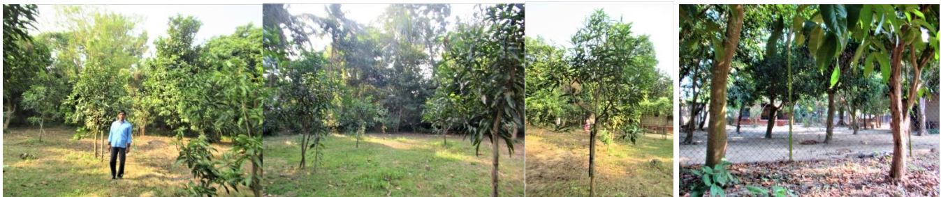
Orchard rehabilitated up to the wire netting of the boys 'Home. But what a labor!