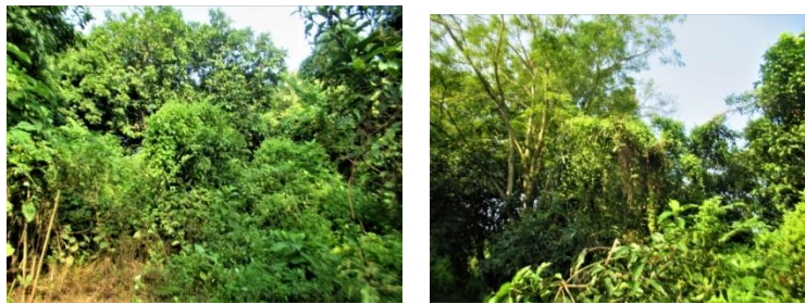
Under this super-vegetation lies an orchard of 25 mangoes-trees planted in 2020