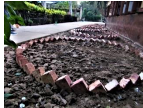
Future flowers garden where three high trees were crushed by the cyclone.