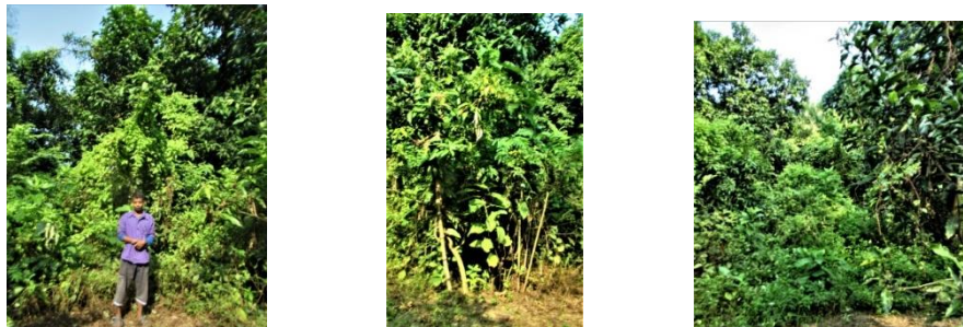
Rakesh started to clean two of them...Many have been attacked by caterpillars!