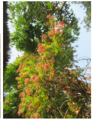
Exuberance of « Madhobi lata » from Sri-Lanka.