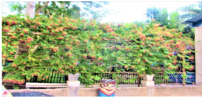
Structures created by Binay with the same flowers in front of the garage.